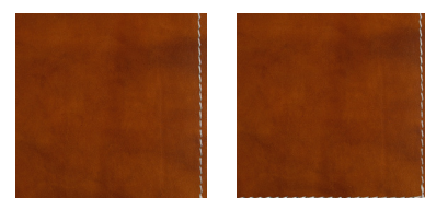
Leather - 9012-M1 (one seam)